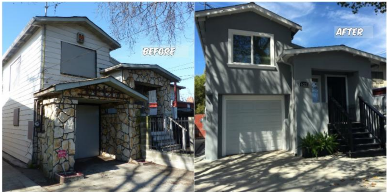
Richmond Housing Renovation's 17th Street Property sold to a happy family in 2016.